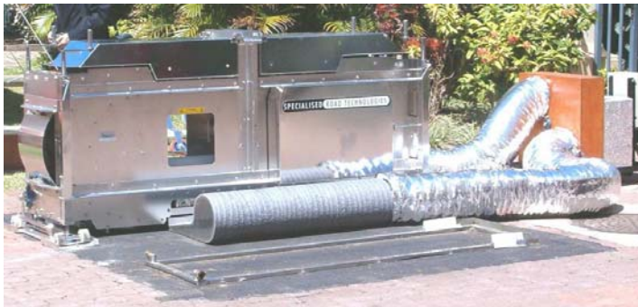
Supplemented by 1/3 scale MMLS3